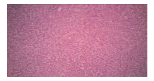
Fig. 1: low power view (10x) showing fatty change in liver

On external examination, there was no evidence of icterus, oedema, cyanosis, lymphadenopathy, prematurity or external congenital anomalies. There was mild hepatomegaly with liver being two fingers below costal margins.On systemic examination, liver weighed 60 gms and was pale yellow in colour. Microscopy of liver revealed panlobular macrovesicular fatty change with hepatocytic nucleus pushed to periphery. There was no evidence of cholestasis. PAS with diastase stain done on section of liver was not contributing for glycogen storage disease. Frozen section of liver stained with Sudan III revealed fat droplets in hepatocytes. The extract of liver homogenate was grossly fatty and showed cholesterol and triglyceride content to be one and a half and two times more respectively and glucose content to half that of control neonatal liver.